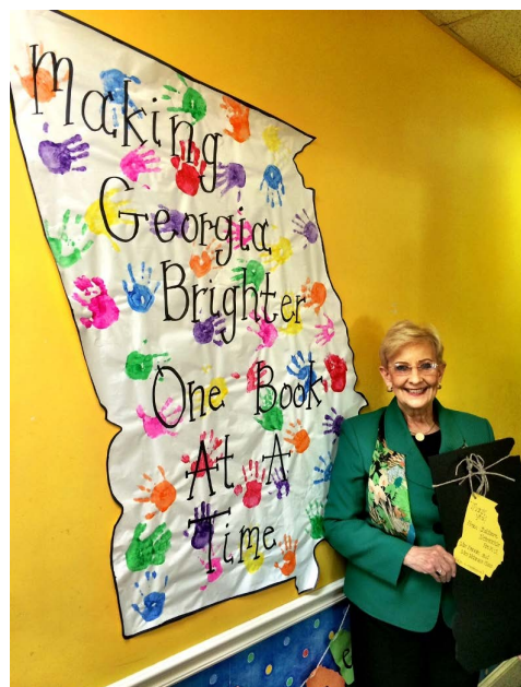
First Lady Sandra Deal is pictured above at Childcare Network #126 in Thomaston. The photo below was taken during a visit by Governor Nathan Deal and the First Lady

Child care centers and public schools across the state celebrated Georgia's Pre-K Week October 6-10, welcoming more than 150 state, business, and community leaders into their classrooms to learn more about the value of early childhood education. The event was hosted again this year by Voices for Georgia's Children and supported by Georgia Power, Synovus and Scholastic Corporation.