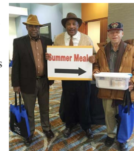
Some lucky participants like these won outreach kits for promoting Summer Meals in their communities.