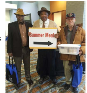
Some lucky participants like these won outreach kits for promoting Summer Meals in their communities.