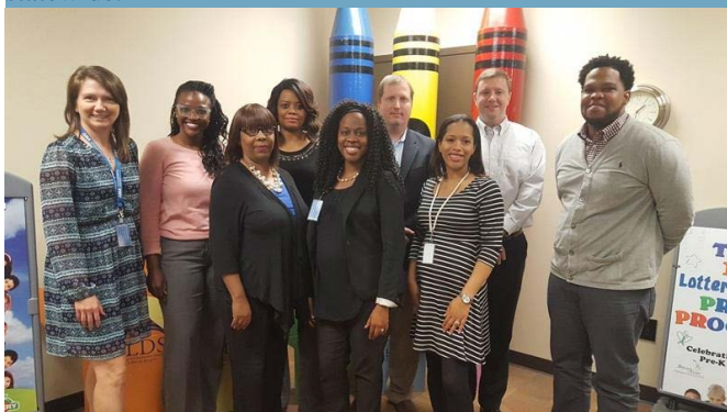
Audits and Compliance Division

The final assessment rated DECAL the highest of the 9 state agencies assessed, and recommended that DECAL work with the Georgia Technology Authority to procure and pilot a fraud, waste, and abuse system that may later be utilized statewide.