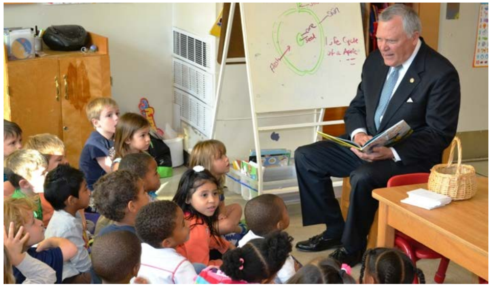
Georgia Governor Nathan Deal enjoys reading to a Pre-K class, which he and First Lady Sandra Deal will be doing during Georgia Pre-K Week October 6 - 10.

DALTON: 3:00 - 4:00 PM Whitfield - Dalton Day Care Center Alan S. & Shirley J. Lorberbaum Center 515 South Pentz Street Dalton, GA 30720 Click here to RSVP.