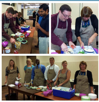
The DECAL Senior Leadership Team raised money for SSCP with a "sundae sale."