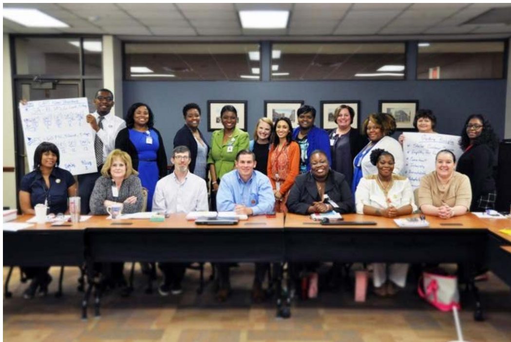
The new CAPS management team recently met in Atlanta.

Imagine for a moment that your manager has given you a small briefcase with $1,000,000.00 of DECAL's money inside it. She has told you that it is your responsibility to keep this money safe and make sure that