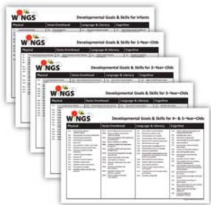
Developmental Goals & Skills Charts