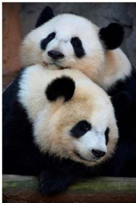
Educator Appreciation Day on September 17, 2016 gives educators and their guests an opportunity to visit Zoo Atlanta, home to orangutans Madu and Keju (pictured below) and giant panda twins Mei Lun and Mei Huan (at left) among many other animals.

In addition, guests will receive a coupon for 10 percent off purchases in the gift shop and food outlets (coupon valid on September 17 only). For more information on Zoo Atlanta's Educator Appreciation Day, call 404-624-5822 or e-mail education@zooatlanta.org .