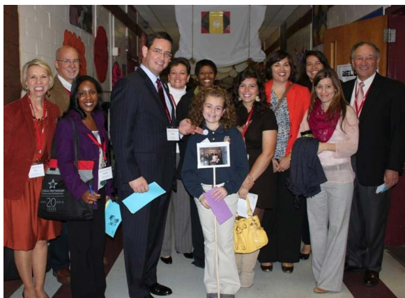
Tour group stops for "pinning" of their guide at Marietta Center for Advanced Academics

The purpose of this annual event, which began in 1993, is to celebrate achievement in public schools and to share best practices across the state. More information about the bus trip is available on the GPEE website .