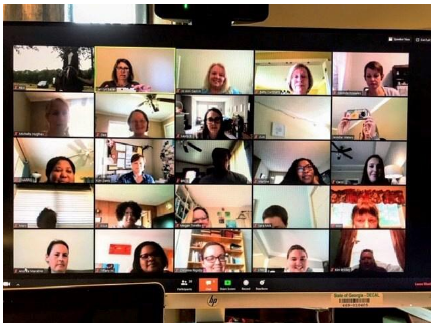
Zoom and Skype meetings have become part of our new normal at DECAL.