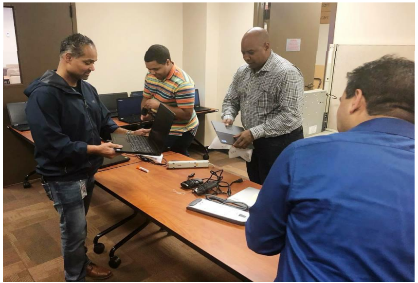
The IT team equipped CAPS employees to work from home during COVID-19.

CCS is the foundation of the agency, and I'm so impressed with your dedication and your innovation. You're finding new ways to support providers while at the same time finding new ways to keep children healthy and safe. You're also taking care of each other through phone calls, zoom meetings, inspirational quotes, and funny memes. That's what makes us such a great team. Thank you, thank you, thank you for all you do!