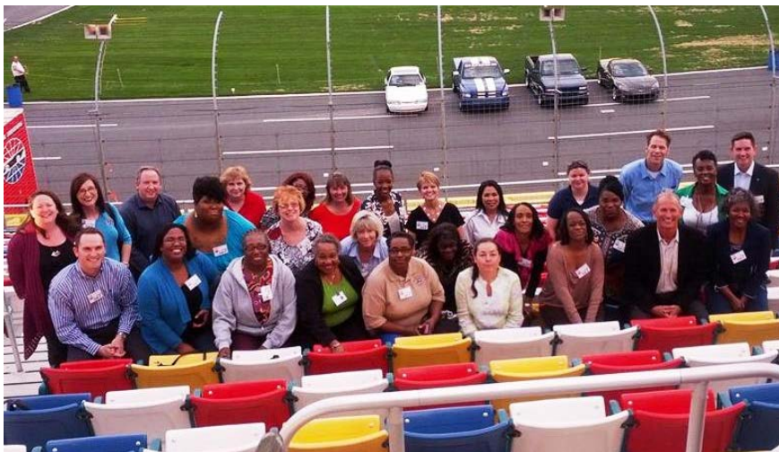
Nutritionists pose at the Charlotte Motor Speedway.