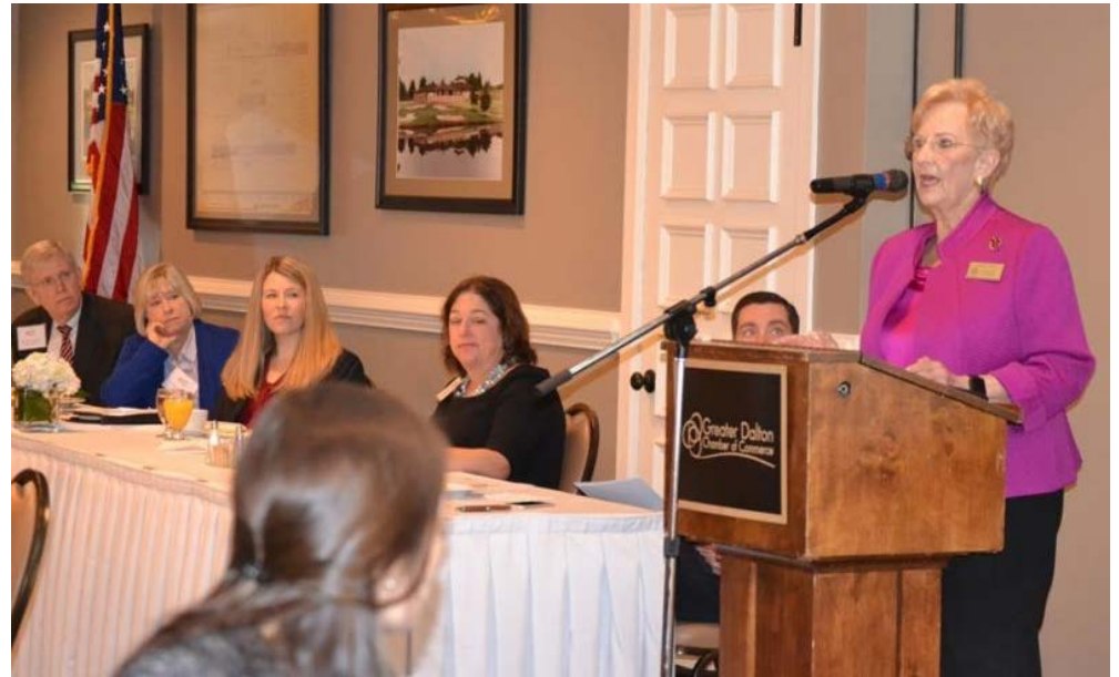
Georgia's First Lady Sandra Deal spoke in February at a breakfast at the Dalton Golf and Country Club to promote Quality Rated.