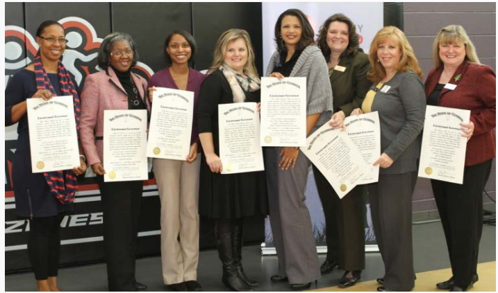
The first Quality Rated programs in Georgia received commendations at the December 14 event with Dole Foods and Healthy Kids Georgia.