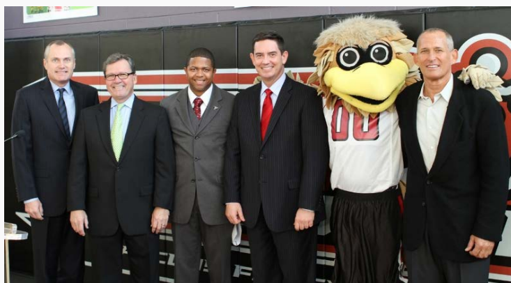
Officials with Dole Foods, Healthy Kids Georgia, YMCA, DECAL and the Atlanta Falcons announce partnership.