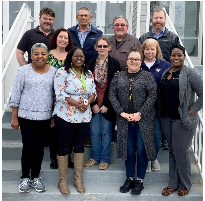
Members of the Audits and Compliance Team recently received their CAPS Compliance Training at Veterans State Park in Cordele.