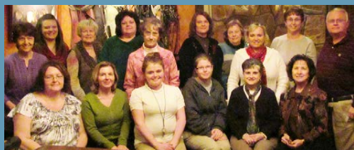
Kudos to Ellijay First Baptist Church DECAL congratulates Ellijay First Baptist Church Weekday Center on becoming Georgia's first 3-star Quality Rated child care center.