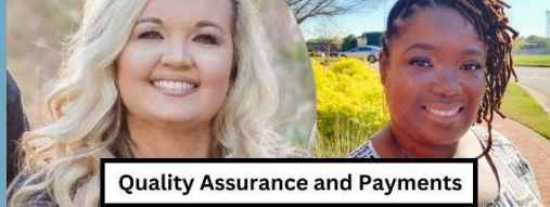
Quality Assurance and Payments