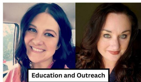
Education and Outreach