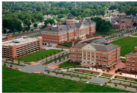
North Carolina Research Campus