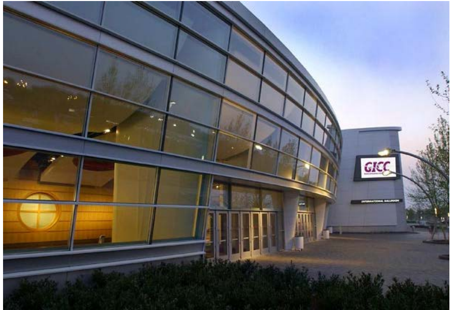
Georgia International Convention Center