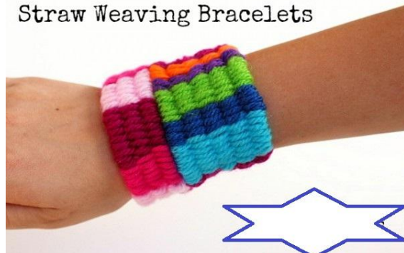
Straw Weaving Bracelets

Click the picture for all the fun details and instructions.