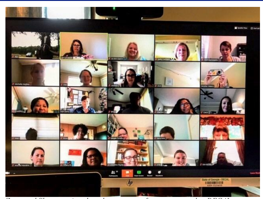
Zoom and Skype meetings have become part of our new normal at DECAL.