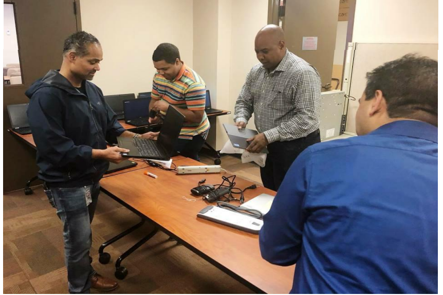
The IT team equipped CAPS employees to work from home during COVID-19.

CCS is the foundation of the agency, and I'm so impressed with your dedication and your innovation. You're finding new ways to support providers while at the same time finding new ways to keep children healthy and safe. You're also taking care of each other through phone calls, zoom meetings, inspirational quotes, and funny memes. That's what makes us such a great team. Thank you, thank you, thank you for all you do!