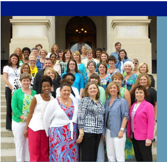
Georgia's Pre-K team members were together in Atlanta recently for a staff meeting. DECAL appreciates the great work they do for Georgia's youngest learners!