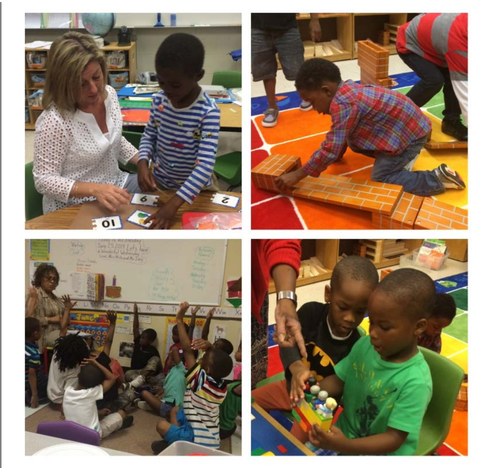
Our Summer Transition Program prepared these rising Kindergarten students at Rainbow Academy and Whitefoord Learning Center for school this fall.