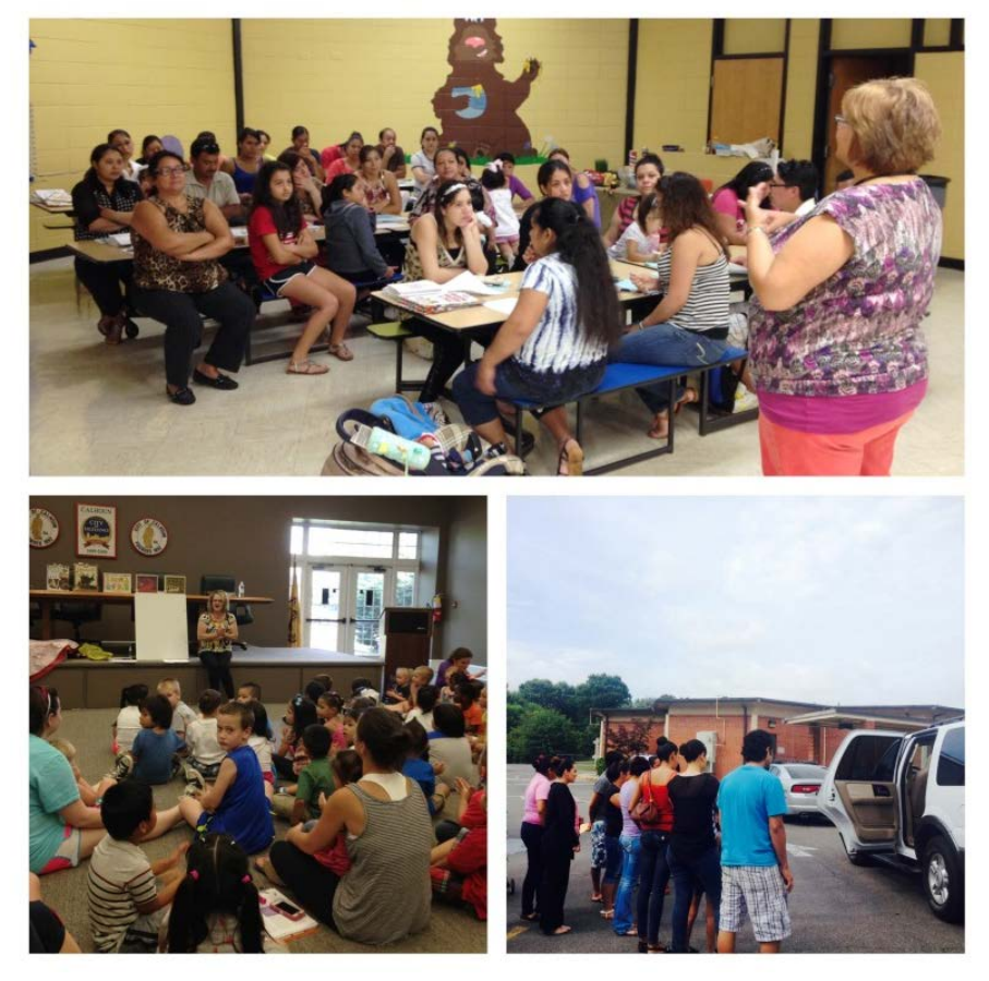
Georgia's Pre-K Program sponsored 20 Rising Pre-K Summer Transition Classes for 280 students who will enter Pre-K this fall. Calhoun City Schools in Gordon County hosted one of the classes this summer with strong parental involvement.

Each year the STP has been evaluated by independent researchers, and results have indicated strong impacts for the children served - especially in crucial language and literacy skills.