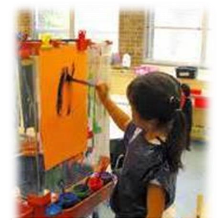
Georgia's Pre-K Program increases school success in later years.

Early education is valuable and important because a child's most significant brain development occurs in the first five years, forming the basis for future learning. DECAL's goal is to lay a solid foundation on which the academic success of Georgia's future leaders and workforce can be built. Investing in Georgia's children and families will pay in dividends for decades to come; through the state's long-term economic growth, and by producing citizens equipped to deal with the challenges of the 21<sup>st</sup> century.