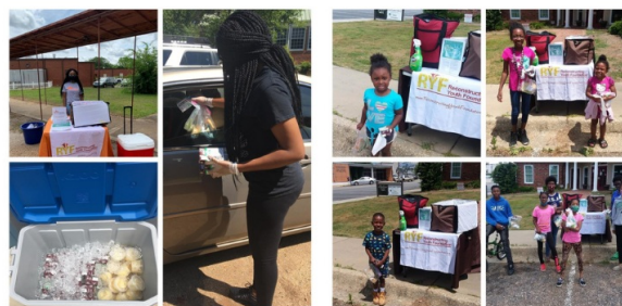
Top: Cars in line for free RYF meals distributed in Randolph County. Bottom: RYF meals being served in Randolph and Clay County