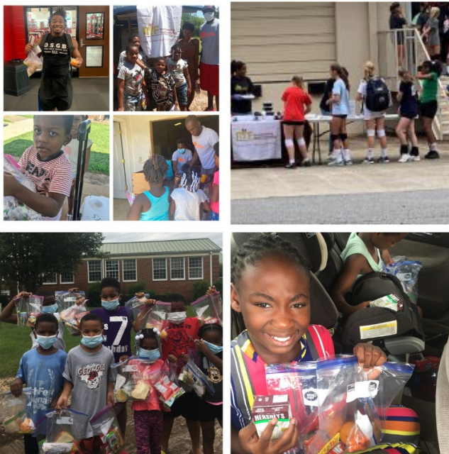
Children receiving their meals from RYF in Lee, Calhoun, Clay and Randolph Counties.

Reconstructing Youth Foundation (RYF), a five-year Summer Food Service Sponsor (SFSP), is a non-profit organization that provides resources for the development of Georgia's youth. They assist at-risk children living in lower income homes who may not typically have access to important resources.