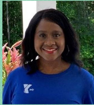
Alderine Healey YMCA Paulding Early Learning Center (Paulding County)