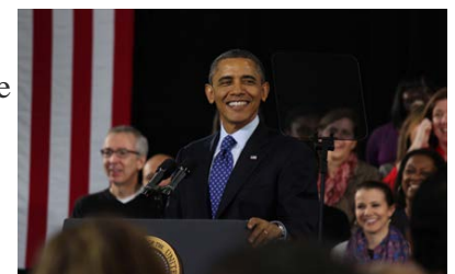
Backed by early education teachers, President Barack Obama speaks to the

Since the presidential visit, many people have asked me how I feel about the president's proposal, and I think the best responses are "intrigued" and "curious." Certainly we're all encouraged by the continuing focus and