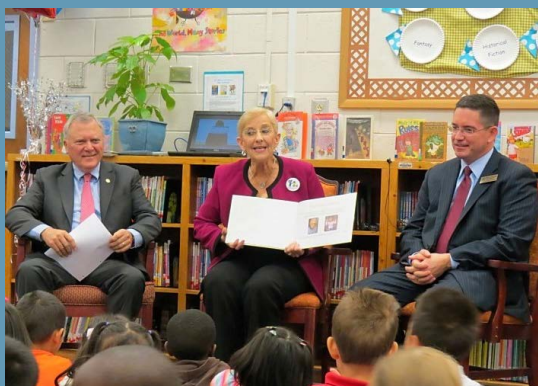
Governor Nathan Deal and First Lady Sandra Deal

"Children model their reading habits by listening to adults," said Mrs. Deal, who will be reading to children in Fannin, Gilmer and Pickens counties. "It is important for children to learn proper pronunciation, expression, pauses and cadence. It is my hope that Georgia Reads Aloud Day encourages our children to read to others and become young teachers themselves."