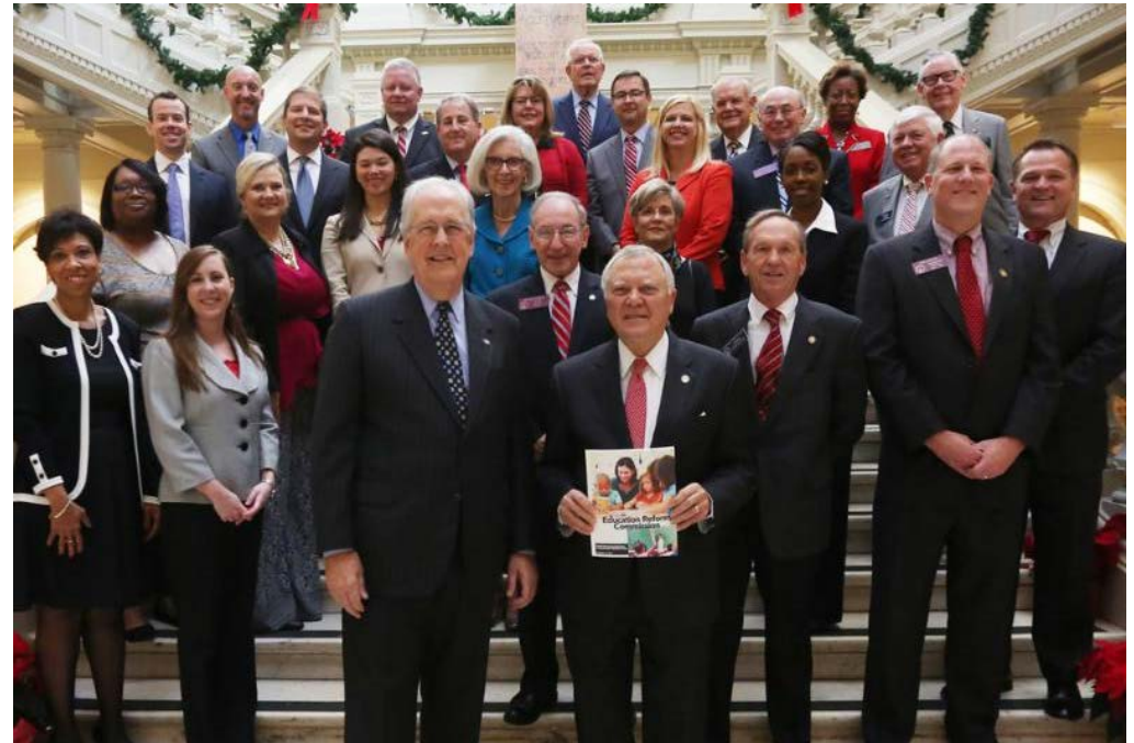
Governor Nathan Deal received recommendations from the Governor's Education Reform Commission.