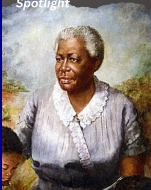
Lucy Craft Laney

This portrait was the first of an African American woman to be displayed at the Georgia State Capitol.