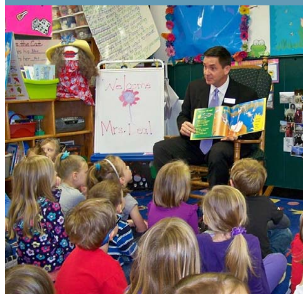
During the Pre-K School year, Commissioner Cagle visits many schools to read to students.

4,500 - Children enrolled in blended Head Start/Pre-K Program in Georgia