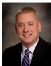
Rusty Haygood Deputy Commissioner, Georgia Department of Community Affairs