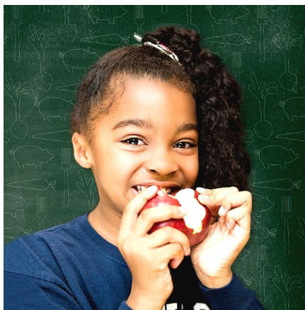
Procuring Local Foods for Child Nutrition Programs

USDA Food and Nutrition Service U.S. DEPARTMENT OF AGRICULTURE