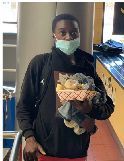
TCCHS student athletes are able to pick up supper after attending study hall and afternoon practice.