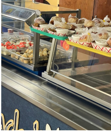
Students staying after school receive a hot supper. Due to COVID safety precautions and available waivers, TCCHS manager pre-plates the meals and coaches can help pass them out in the evening.

Dr. Duplantis expressed parents (and students) are very pleased with the supper program and are appreciative of the additional effort to feed their kids.