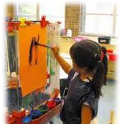
Georgia’s Pre-K Program increases school success in later years.

Early education is valuable and important because a child’s most significant brain development occurs in the first five years, forming the basis for future learning. DECAL’s goal is to lay a solid foundation on which the academic success of Georgia’s future leaders and workforce can be built. Investing in Georgia’s children and families will pay in dividends for decades to come; through the state’s long-term economic growth, and by producing citizens equipped to deal with the challenges of the 21 st century.